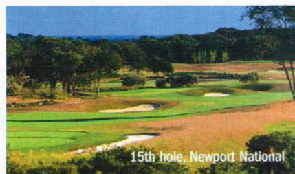
15th hole, Newport National

seasonal ingredients. 22 Bowen's Wine Bar & Grille is a first-rate steakhouse. The Red Parrot offers a Caribbean flavor. For the best burgers,