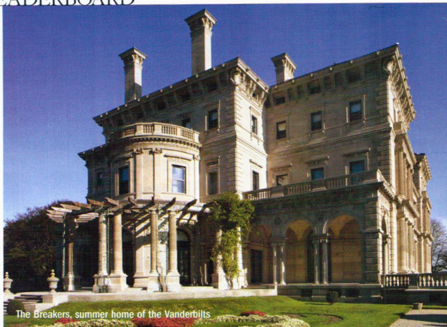
The Breakers, summer home of the Vanderbilts