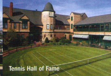
Tennis Hall of Fame