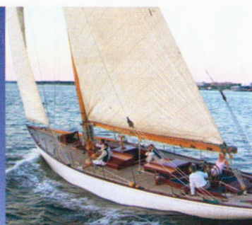
Sailing away: a classic 12-meter boat